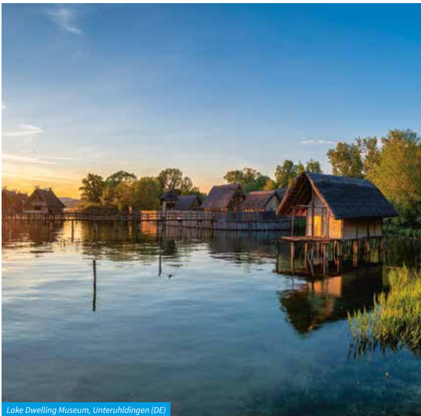
Lake Dwelling Museum, Unteruhldingen (DE)